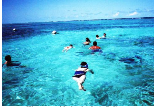
We swam with the sharks in Belize