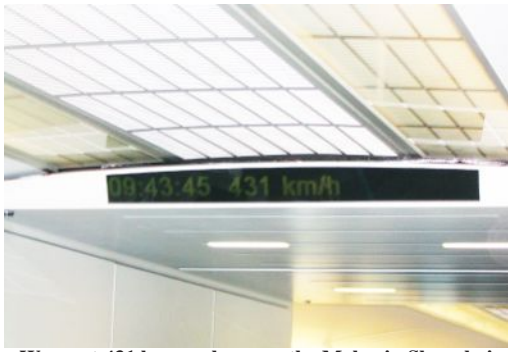
We went 431 km per hour on the Malev in Shanghai