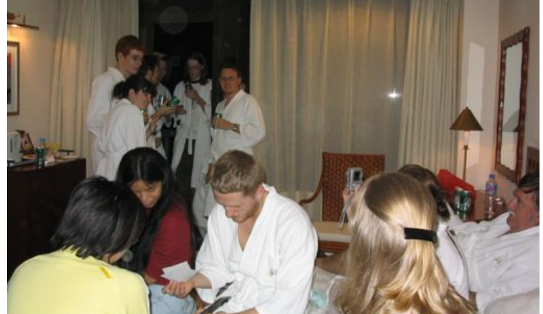
We had a toga party in a Chongqing hotel room