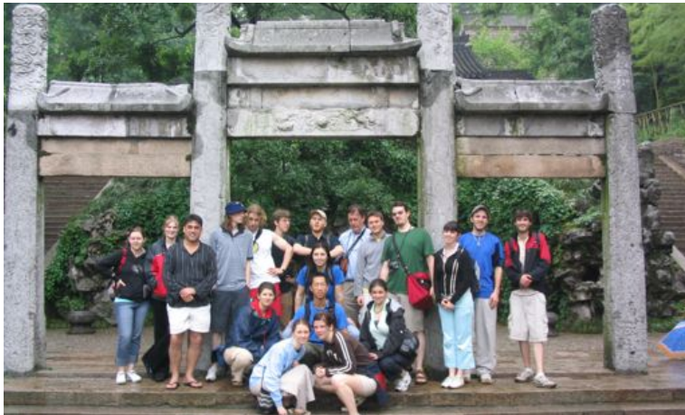
We indulged in symmetry in Korea