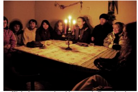
We had a mountain cabin seance in Transylvania