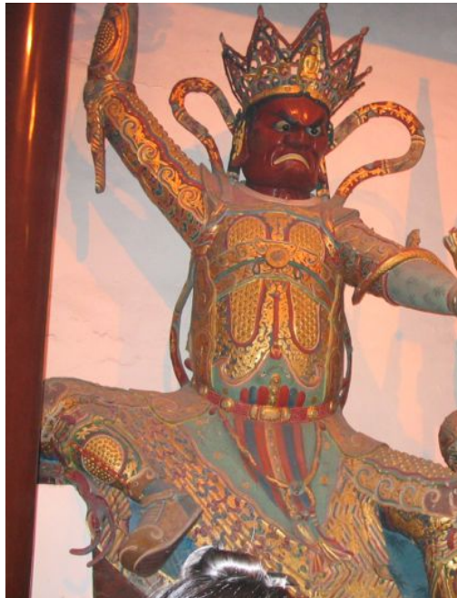
Bruce had a bad rehearsal