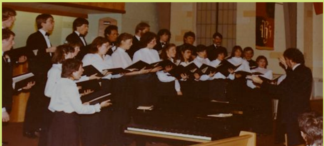
The Chamber Singers in Nelson, BC - February, 1984