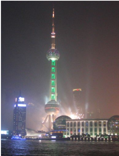
used to be Rice Paddy