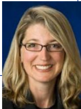
Lana Popham MLA Saanich South