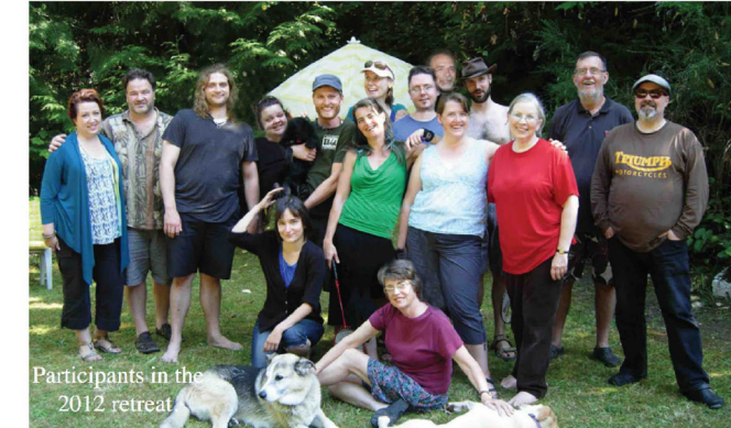
Participants in the 2012 retreat