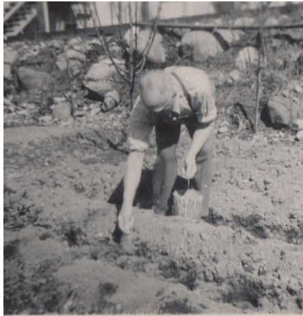
Grampa in 1969 - always the farmer