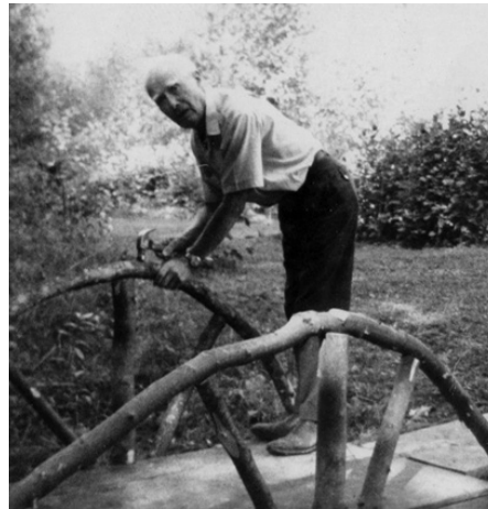
and always the carpenter