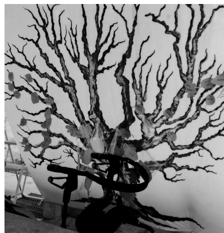
Marina Cotter's "participation tree" 2017