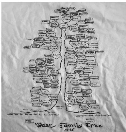
Cousin Helen's family tree t-shirt 1995