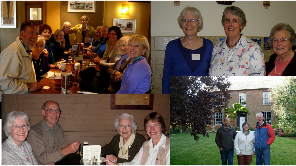
Left to Right, top to bottom