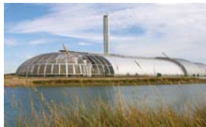
- with its Opera House (actually a recycling centre)