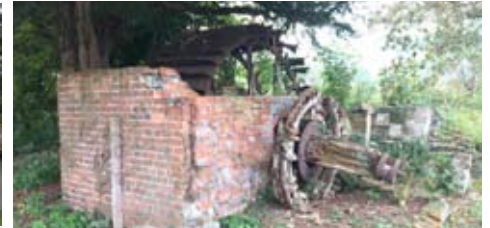
Ruins of Blewbury Mill