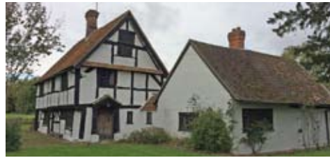
Blewbury Mill HOUSE