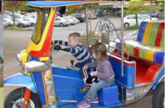
Broadmead Community Day 2012