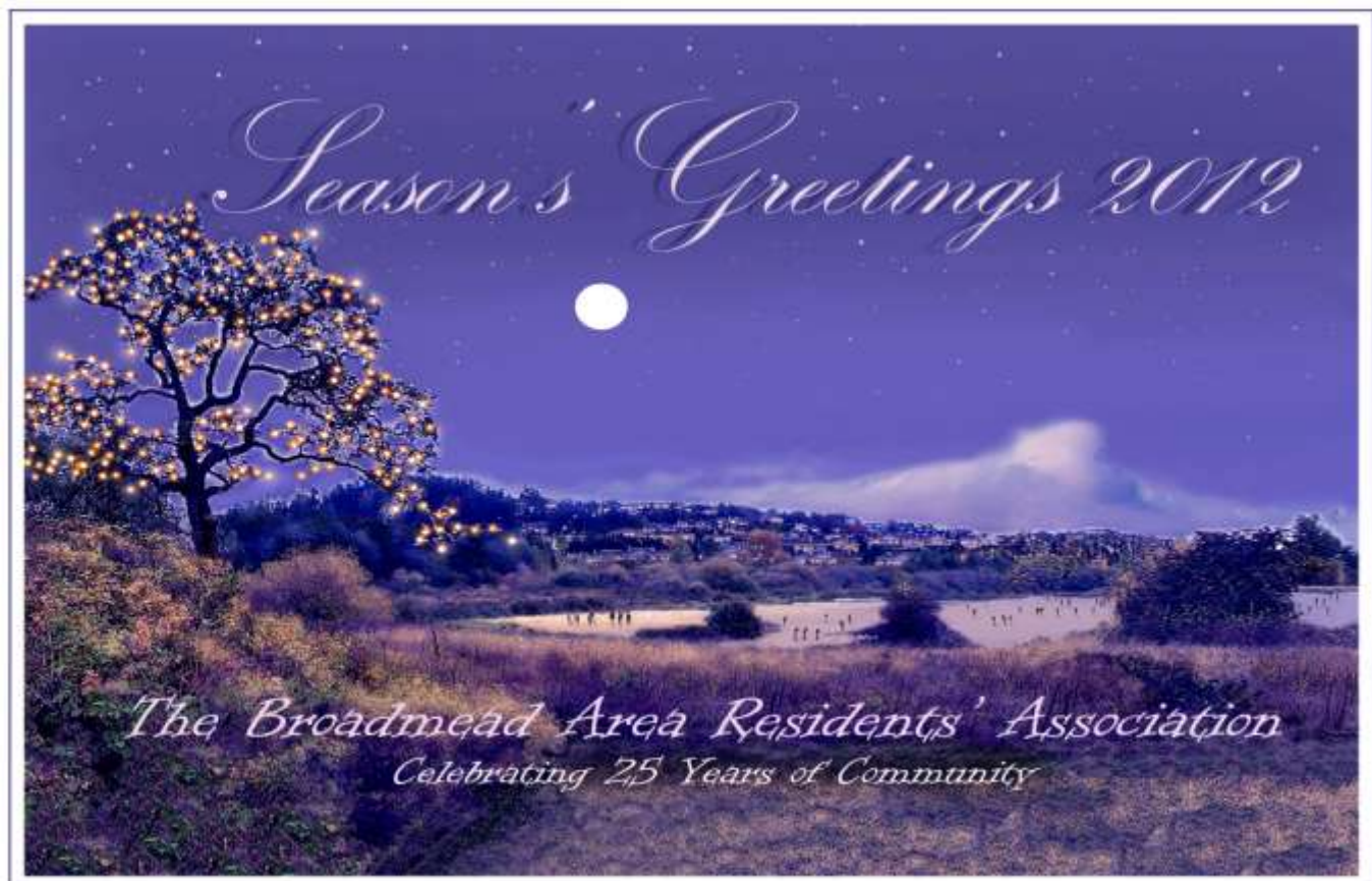
Skaters on Rithet's Bog