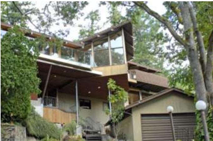
His first Broadmead house