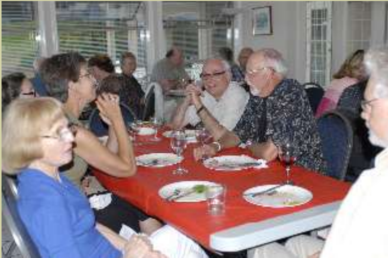
Recognizing BARA Volunteers at the annual pot-luck